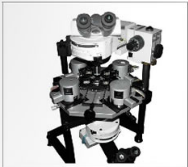
Minus K - Nanonics MultiView 4000 MultiProbe system for scanning probe microscopy permits full integration with optical techniques such as Raman using negative-stiffness vibration isolation.