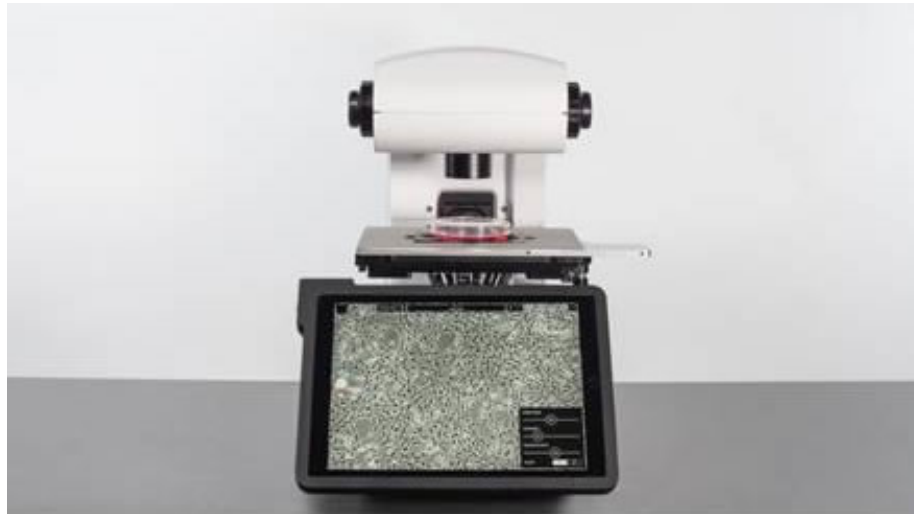
Revolve combines the full functionality of both upright and inverted microscopes.