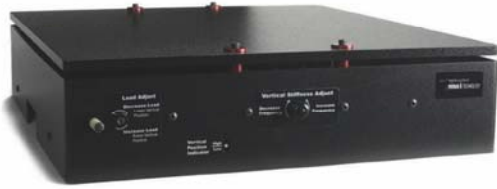
<< Figure 1. Negative-Stiffness vibration isolators - compact, flexible and without the need for compressed air or electricity. >>

Compact, flexible and without the need for compressed air or electricity, Negative-Stiffness vibration isolation with its totally passive mechanical system, is fast becoming the choice of professionals and researchers for use in cleanroom applications where more precise vibration isolation is needed.